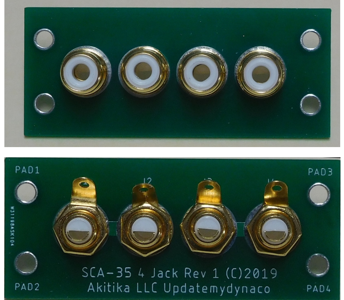
Figure 2-Jack installation, (left channel, white insulator jacks shown) The jack kits are symmetric, and may be built as shown above, or with the board flipped.

It make take a few tries to get the hang of this technique.