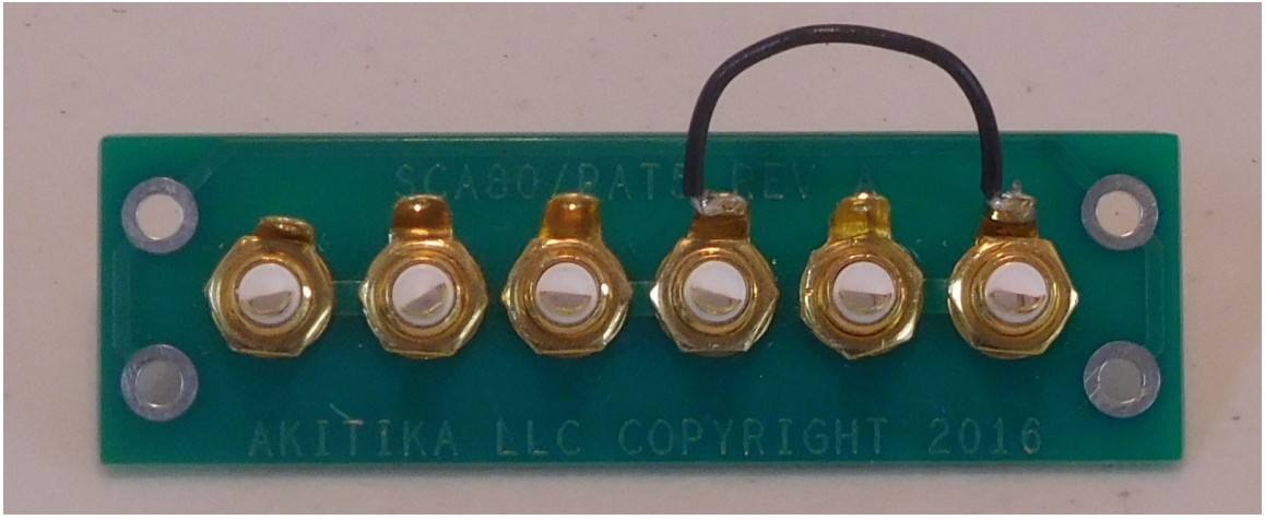
Figure 3-ground jumper installation

The result is that the 4 jacks on the right side of the jack field for the hig-level inputs share a common ground. The 2 low level input jacks on the left of the jack field have a separate ground.