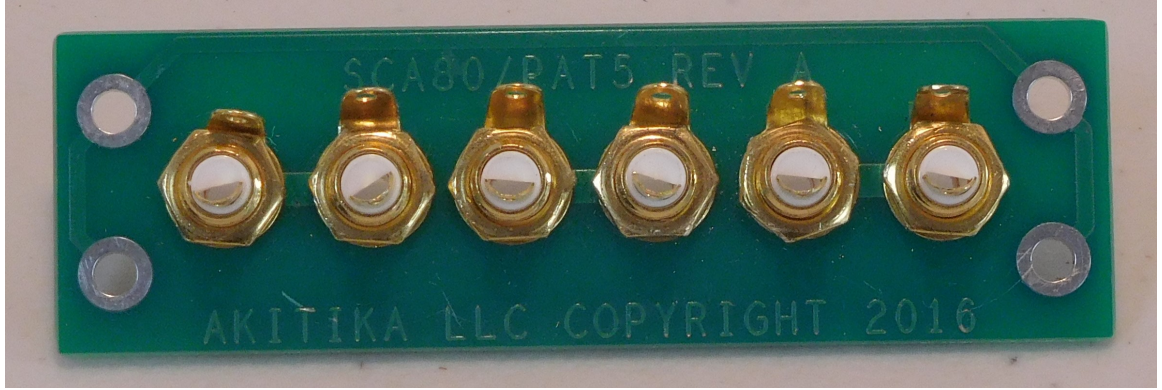
Figure 2-Jack installation, (left channel, white insulator jacks shown)