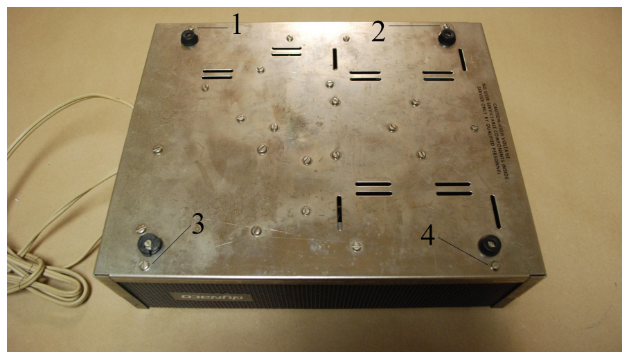
Figure 1-Location of the four screws that hold the cover to the base